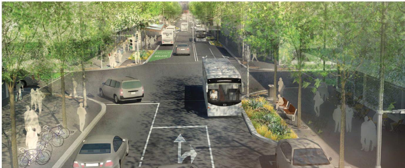
An artist's impression of what Manchester Street will look like when finished.