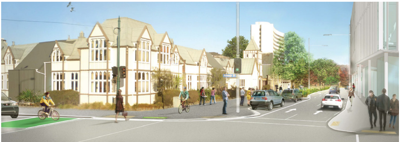
An artist's impression of what Durham Street will look like when finished.