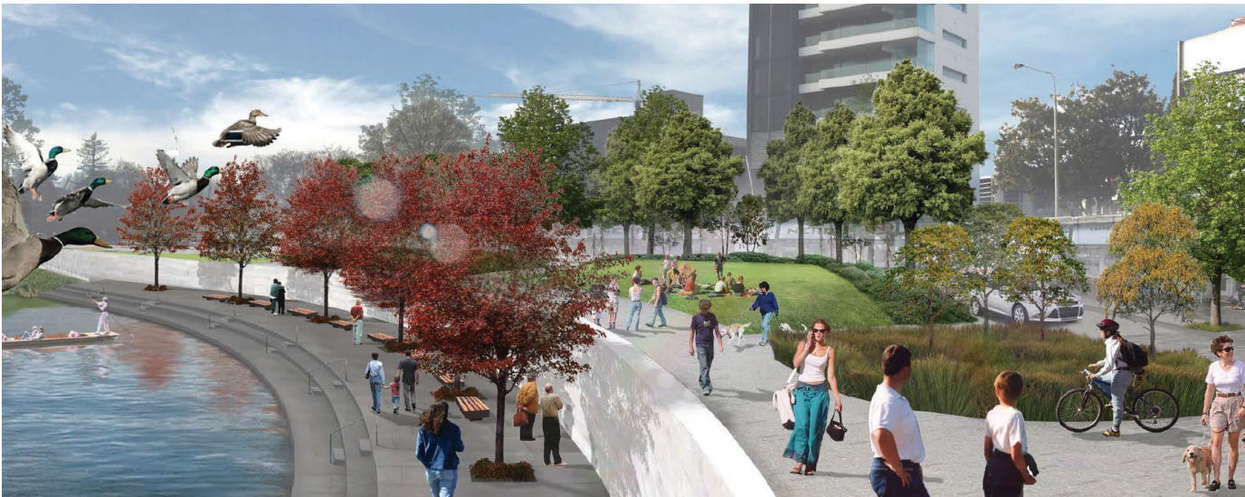
Artist's impression showing how The Promenade along Oxford Terrace, above the Canterbury Earthquake National Memorial, will make the river more people focused.

Cambridge Terrace between Colombo and Manchester Streets