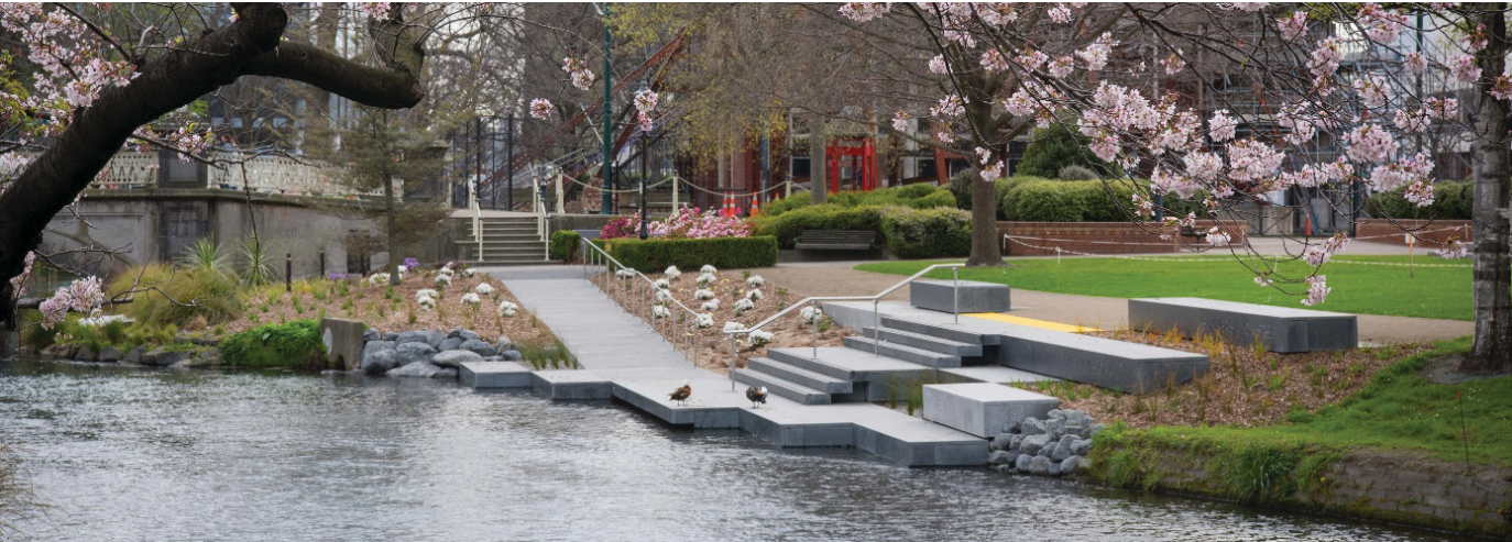
Top and bottom: Areas of the Avon River Precinct that are already finished.

You can provide feedback in person, by email, phone or post: