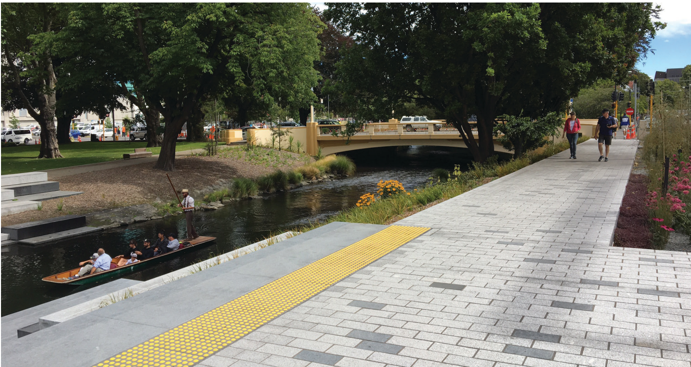
The newly built Promenade on Oxford Terrace leading to the Hereford Street Bridge.