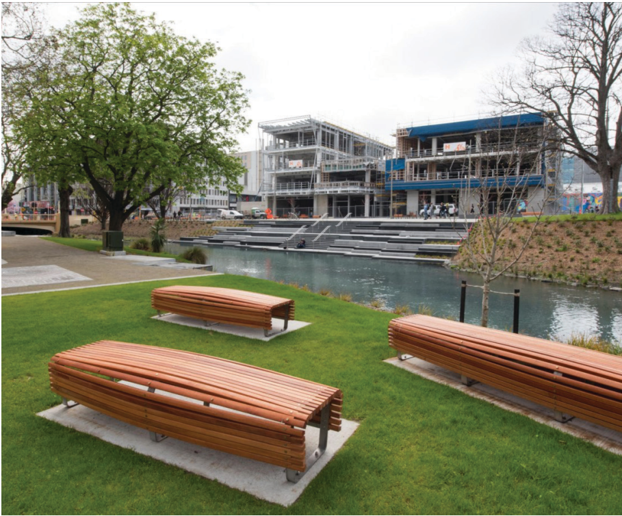
The Terraces and nearby punt stops are beginning to transform the Avon River area.

are becoming available, such as The Crossing on the corner of Cashel and Colombo Streets. The amount of short-term parking is expected to return to pre-earthquake levels. The majority of parking required to meet the needs of businesses, shoppers and commuters will continue to be met by commercial developments. On-street parking within the core will be prioritised for disabled and short stay parking, service vehicles and taxis.