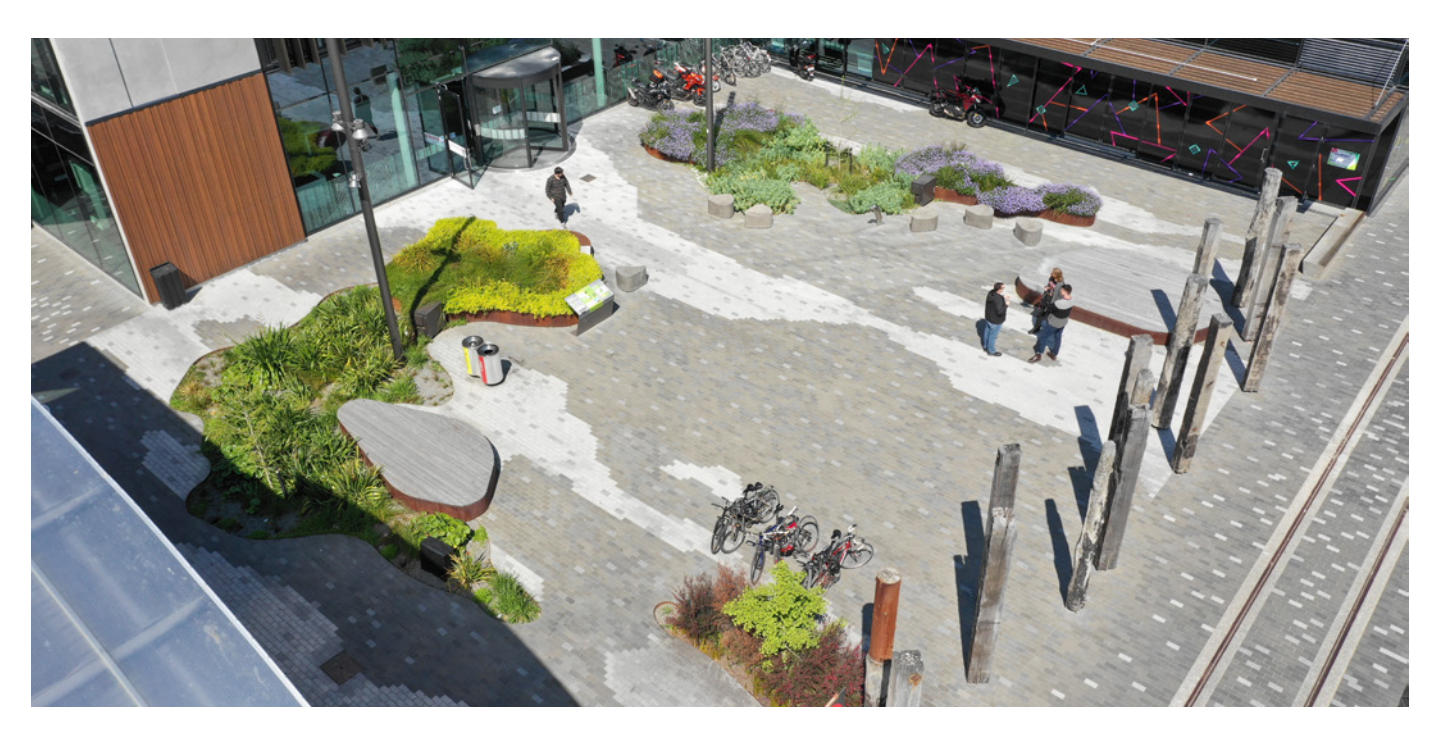
The new Evolution Square public space in the South Frame

Land was initially introduced to the Company through a combination of Crown loans and share capital. Proceeds from the sale of land are retained by the Company after first repaying Crown loans.