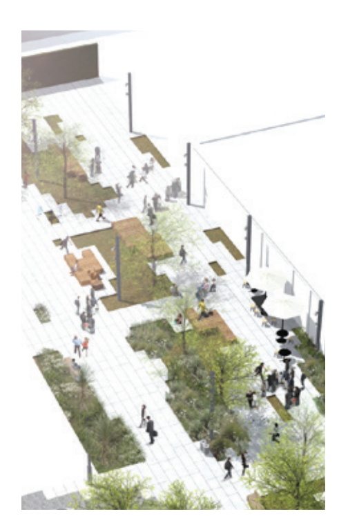
Artist impression of the South Frame, which is being built in stages, as land becomes available.