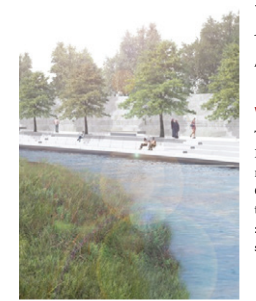
Artist impression of the Canterbury Earthquake National Memorial, showing the reflective space on the north bank of the river and a Memorial Wall on the south bank

The Metro Sports Facility will play an important part in fostering health and wellbeing in the region. It will attract people from across Canterbury and New Zealand. People will be able to play, train, participate and compete in a wide range of sports and recreational facilities for all ages and abilities. It will also offer a pleasant and relaxing space for spectators.