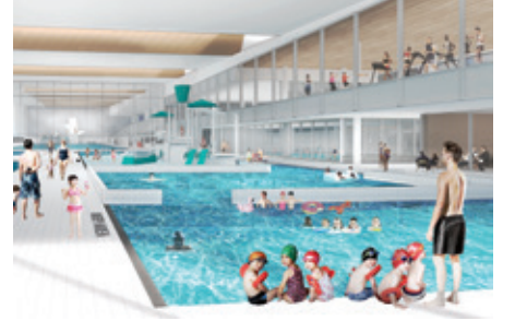
BOTTOM: Artist impression showing the leisure water area.

The earthquakes had a deep effect on the families of those who lost their lives, those involved in the recovery process and the people of Christchurch and Canterbury.