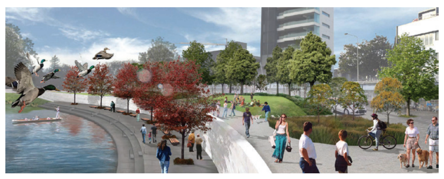
Artist impression of how The Promenade (part of the Te Papa/Avon River Precinct) will look. The Promenade will provide high quality pathways that will make it easier for people to access and enjoy the beautiful river surrounds that are part of Christchurch's identity.

This is a summary of the Anchor Projects. Find out more by visiting the Ōtākaro website at: www.otakaroltd.co.nz