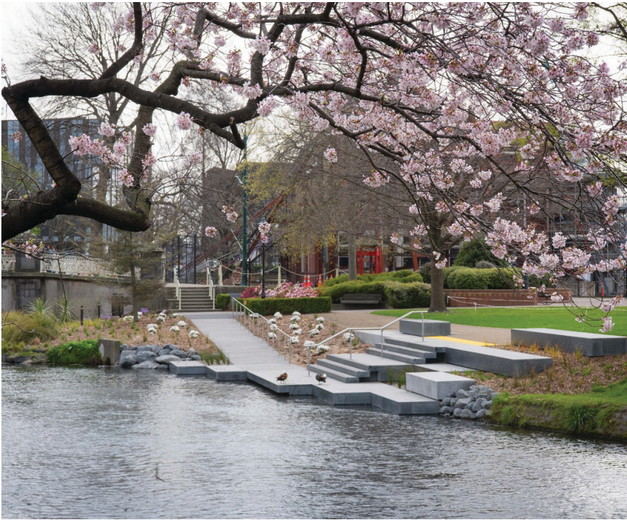
The Terraces and nearby punt stops are beginning to transform the Avon River area.

Parking in the central city is evolving as the rebuild progresses. New, permanent public off-street parking facilities are becoming available, such as The Crossing