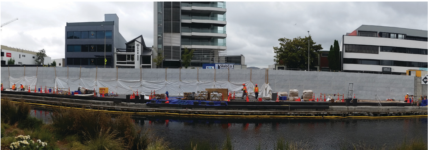
Top: Artist impression showing what The Promenade might look like along Oxford Terrace, above the Canterbury Earthquake National Memorial. Bottom: The Canterbury Earthquake National Memorial being constructed.