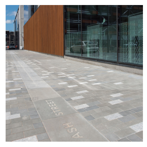
A completed lane in the Innovation Precinct.

Ōtākaro Limited is building a series of new laneways and courtyards in your area, as part of developement of the new South Frame.