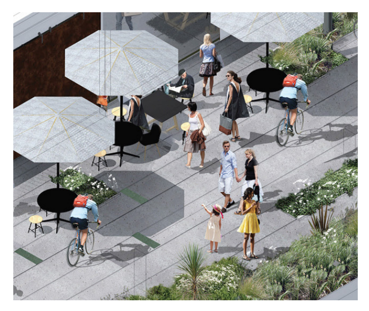
Artist impression showing how The Greenway might look.

Overleaf is a summary of how vehicles, pedestrians and cyclists will use these new laneways.