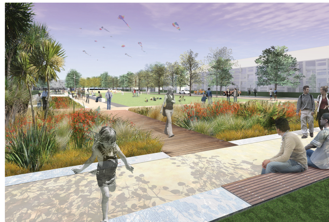
Artist impression showing how the East Frame park could look. It will be the third largest park in central Christchurch.