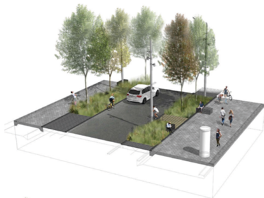
Top: Artist impression showing the streetscape for Worcester Street through the East Frame. There will be seating and landscaping. The existing 20 metre road reserve will support pedestrian, cycling, private vehicle and bus movements into and out of the central city.

*Following public consultation and advice, Christchurch City Council, the Crown and Ngai Tahu produced the Christchurch Central Recovery Plan (CCRP) in July 2012. The CCRP outlined the regeneration vision for Christchurch, including key Anchor Projects that will stimulate further development, and optimise confidence and the city's regeneration.