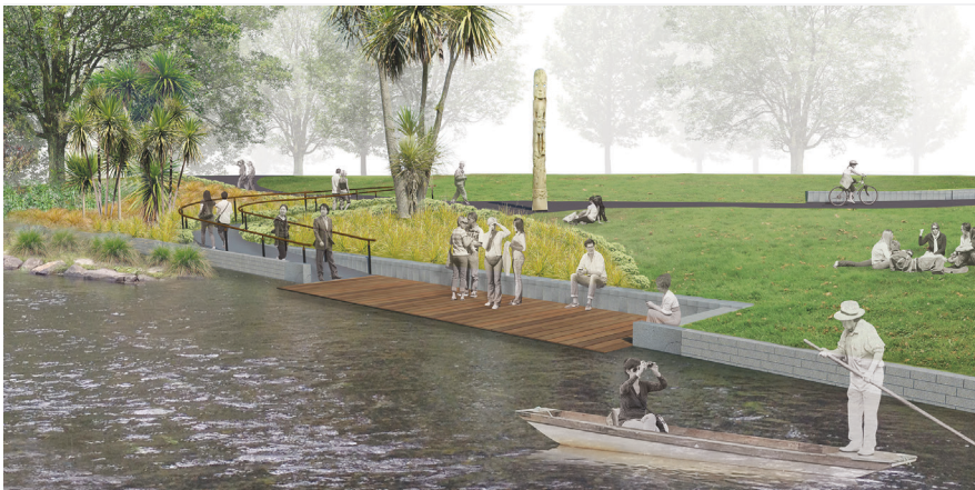
Artist impressions of restored Victoria Square.

On street parking along Armagh Street and Colombo Street is changing to better suit the future uses of the area.