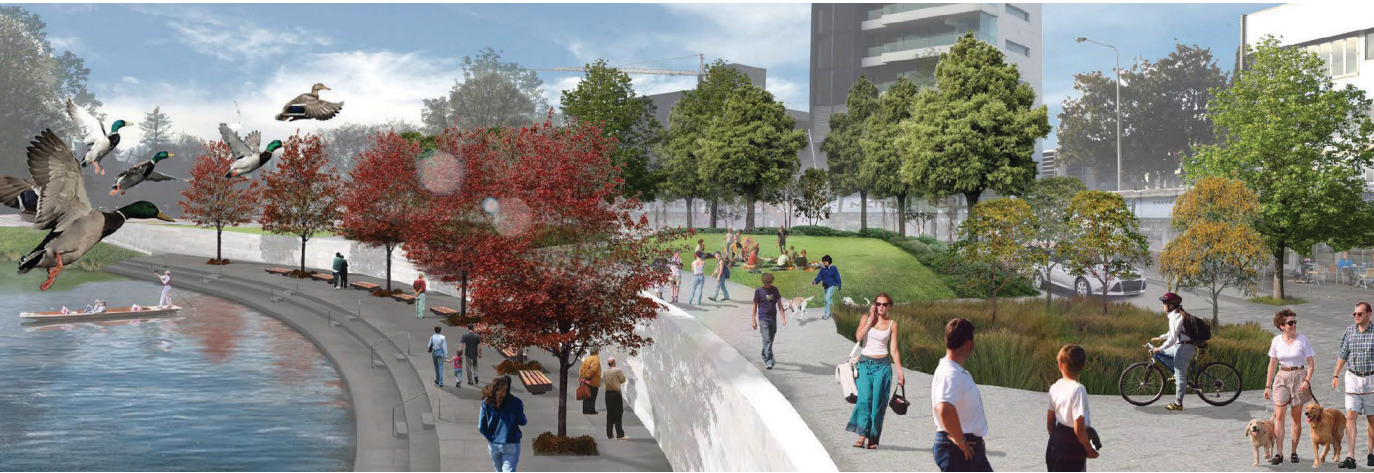
Artist's impression showing how The Promenade along Oxford Terrace, above the Canterbury Earthquake National Memorial, will make the river more people focused.

You can provide feedback in person, by email, phone or post: