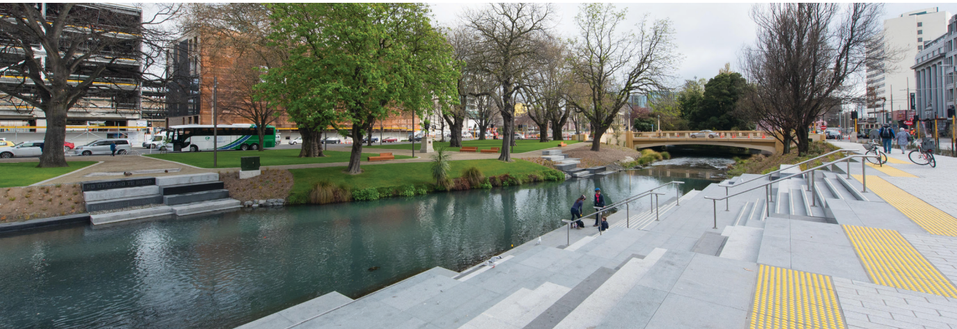
The recently finished sections of the Avon River Precinct are already bringing the river area back to life and making it more accessible.